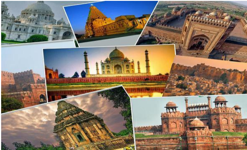
(Some famous places in India)

Learning objectives: Students will know about the life in china and india and their cultures