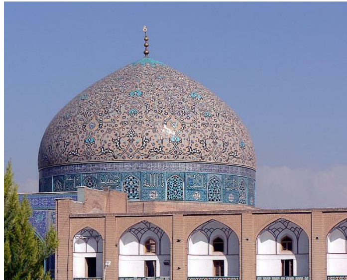
(Sheikh Lutfullah Masjid, Isfahan) in Iran