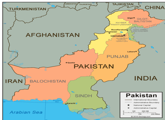
(Pakistan neighboring countries)

Learning Objective: Students will be able to list the neighbours of Pakistan and to describe the life in Iran